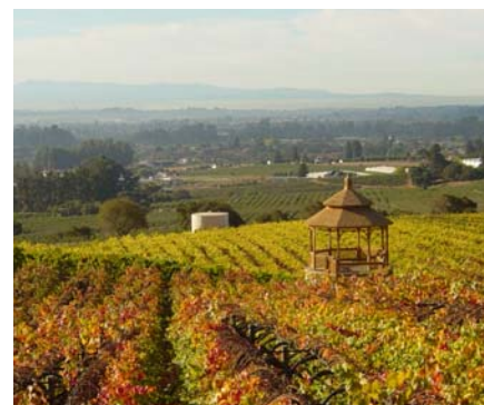
Regan Vineyards in Corralitos, CA.